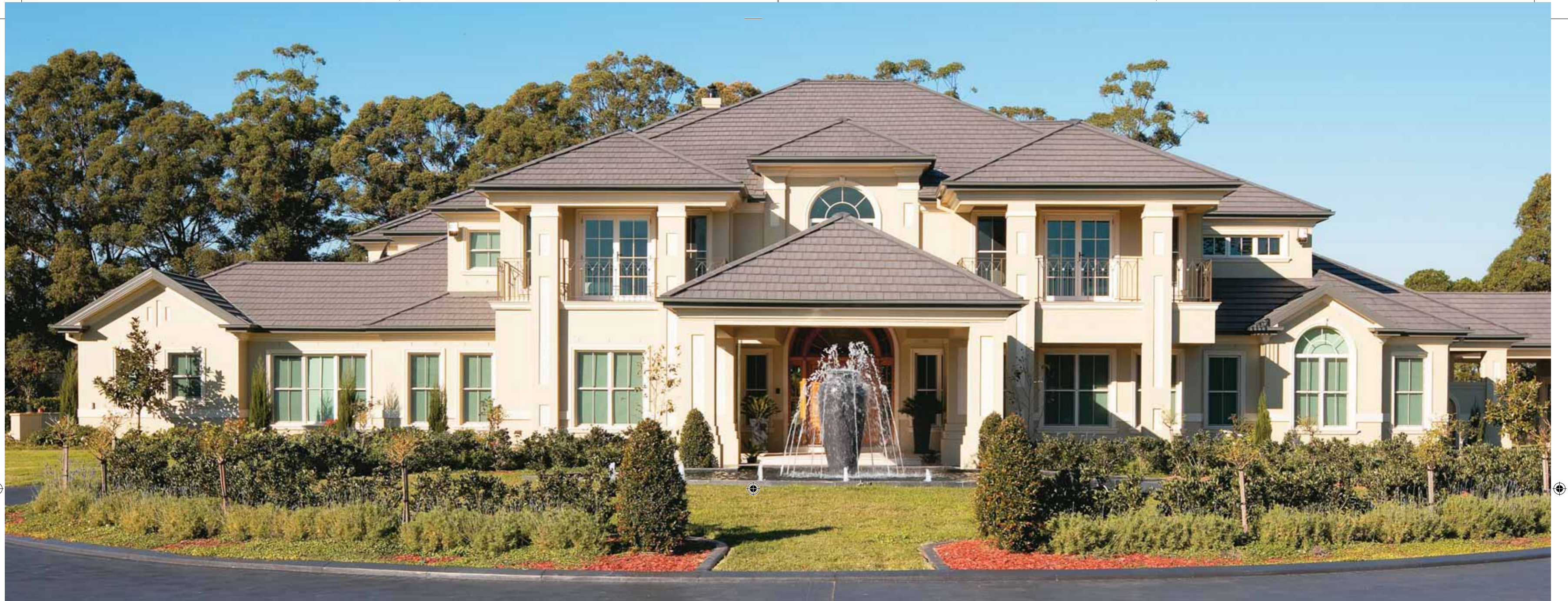
ABOVE: The front of the house is alluringly dynamic and multidimensional, with a grand circular driveway and water feature RIGHT: The huge indoor pool