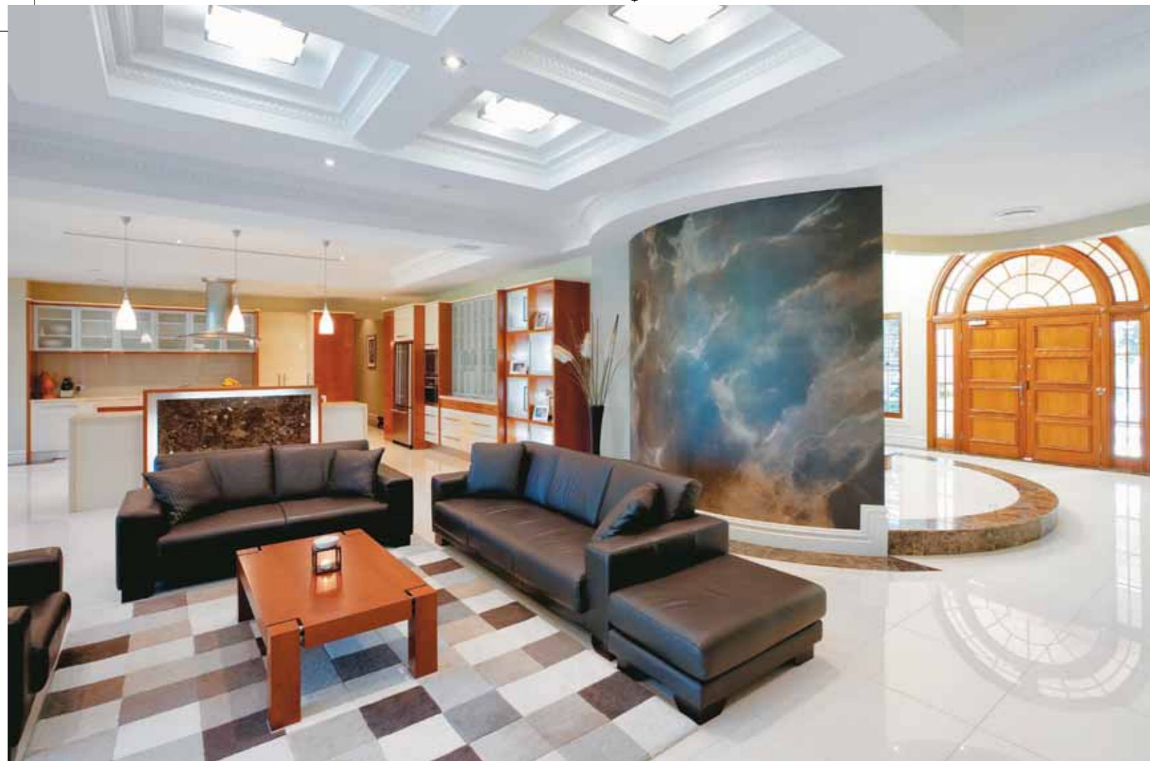
ABOVE: A sitting area and kitchen are tucked away from the entrance BELOW: The large bathrooms feature double vanities and spa OPPOSITE: An absolutely stunning staircase provides the main focal point in the home

as seen with the extraordinary Gone with the Wind staircase. A central showpiece of the home, the curved staircase features a decorative wrought-iron balustrade and stained timber handrails.